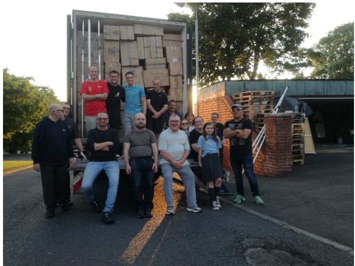
THE VOLUNTEERS AND PARISHIONERS OF ST BRIDES CHURCH